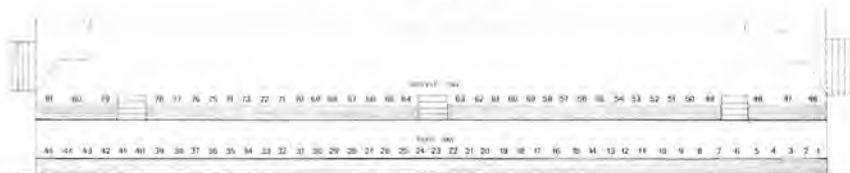
Candlestick Park — PRESS BOX